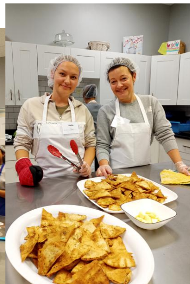
Newcomer Women's Group cooking workshop at the CDC-Community Development Centre