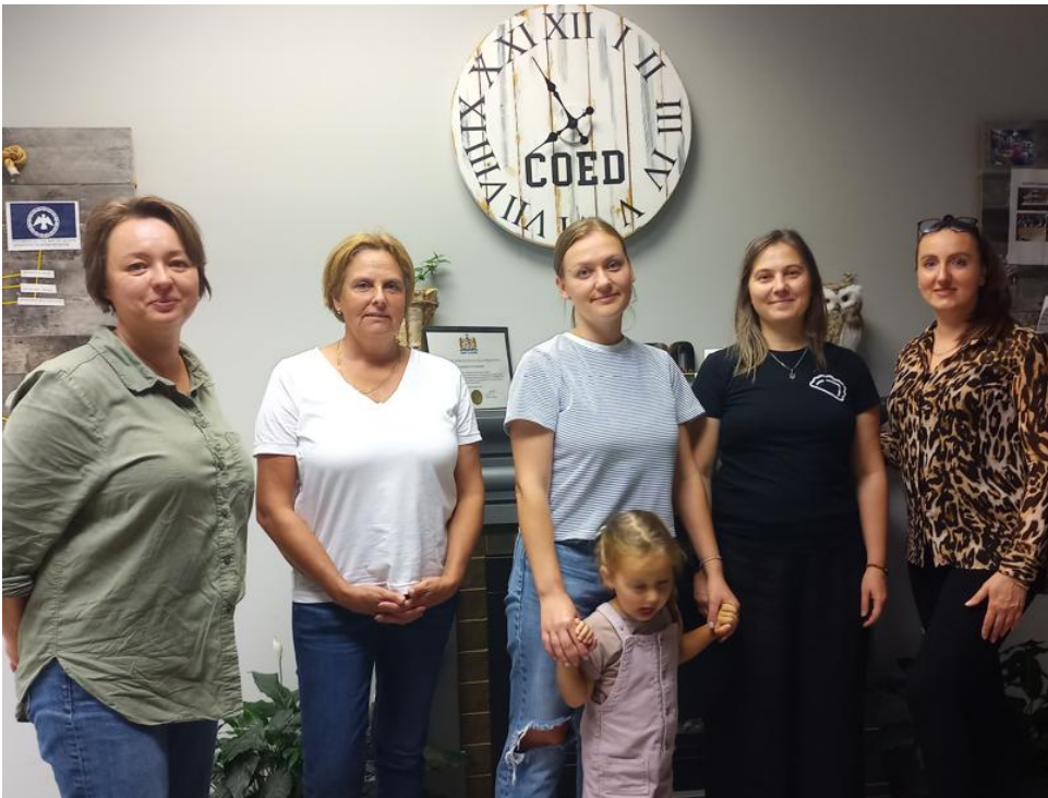
QUIS' long-term partner: Continuing on in Education (COED)