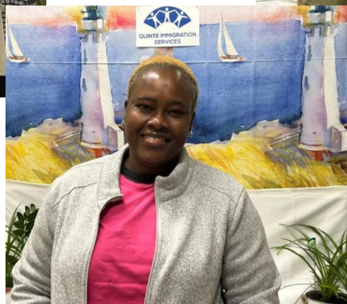
Open Doors at QUIS, October 2024