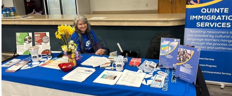
VIQ Fair, March 2025

Other initiatives this year have centred on working with regional school boards to build capacity for successful implementation of the Settlement Workers in Schools (SWIS) programming, supporting newcomer workers through the QLIP Newcomer Workers Working Group around employment crisis response and development of foundational work to assess worker needs. Additionally, the coordination of the Healthcare Roundtable focused this year on Gender-based violence and the Ontario Health Team Primary Healthcare implementation plan. QLIP also supported Belleville Quinte West