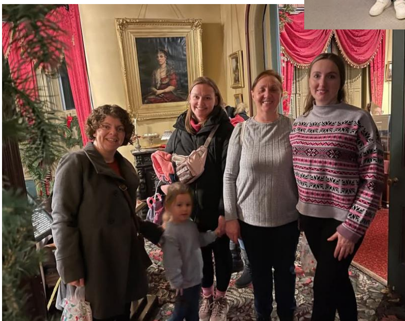
Newcomer Women's Group visit to the Glanmore Historic Site, December 2024