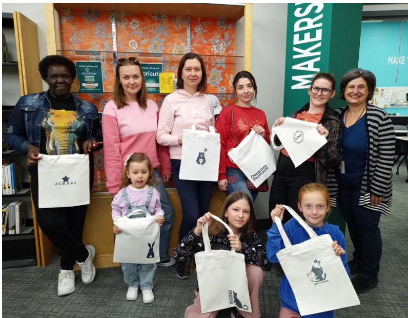
Handmade bags' workshop at the Quinte West Public Library, July 2024