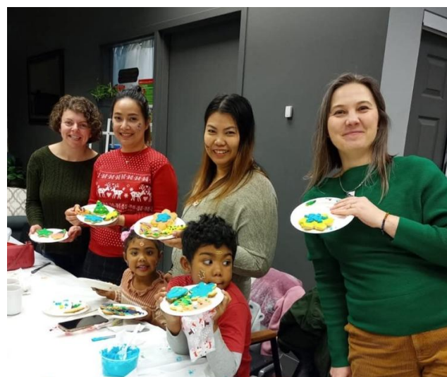
Cookies decoration workshop at the COED, December 2024