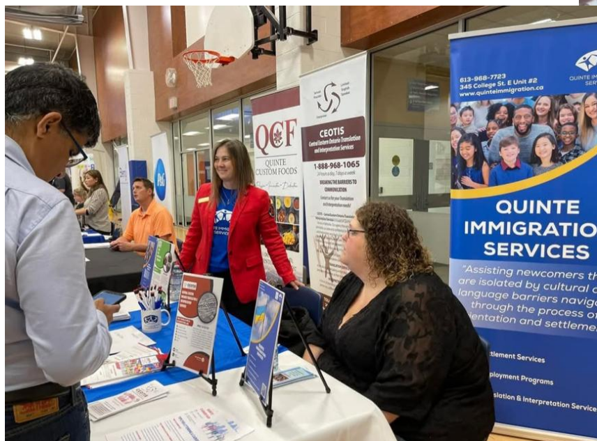
Quinte Career Fair, October 2024