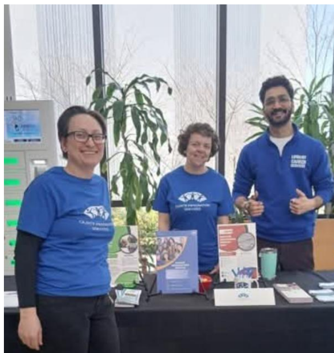
Career Fair at the Loyalist College, March 2025