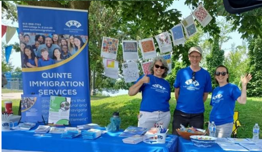
Belleville Waterfront Festival: Multicultural Canvas, July 2024