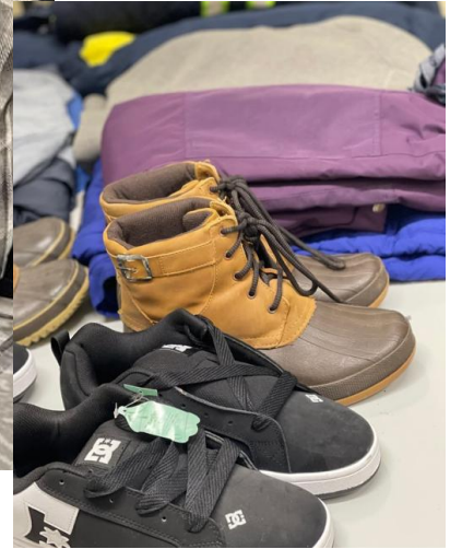
Free winter clothes for our clients, November-December 2024