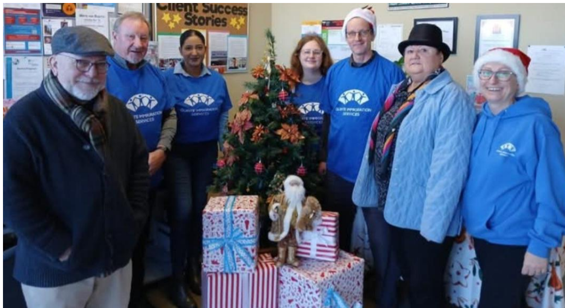
Winter Holidays at the QUIS office, December 2024