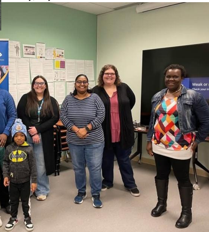
Newcomer Women's Group meetup at the BQWCHC, March 2025