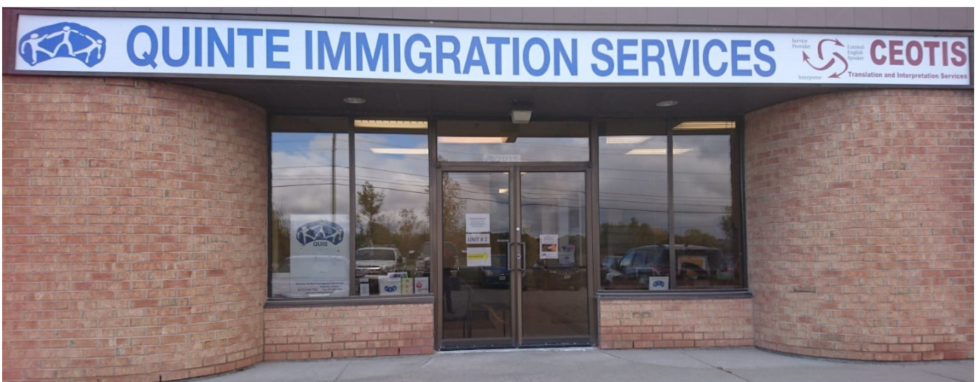
Pictured above: Our new office location